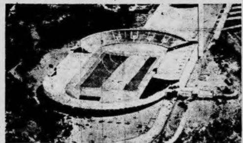
The United States Olympic committee will accept Finland's invitation to the 1940 Olympics at a special meeting held in New York Monday, December 5. Photograph shows the new Olympic stadium at Helsinki, Finland, where games will open July 20, 1940.