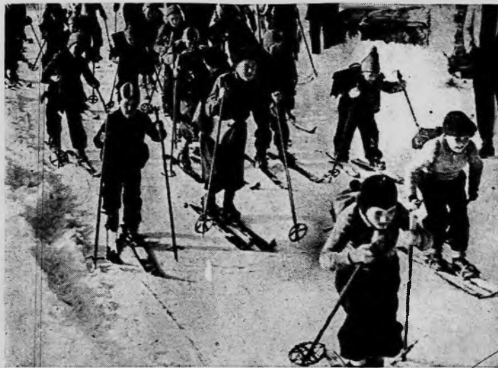
One day each week the school children of the little town of Igls in the Austrian Tyrol must take a compulsory skiing lesson, under the instruction of famous skiers. Here starting out on a skiing lesson are a group of youngsters. Judging from the smiles on their faces and their enthusiasm, this is one class they thoroughly enjoy.