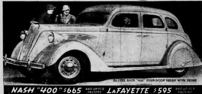
NASH "400" $665 AND UP FOR FACTORY LAFAYETTE $595 AND UP FOR FACTORY

The only cars in the low-price fields that offer you the gas-saving Automatic Cruising Gear!