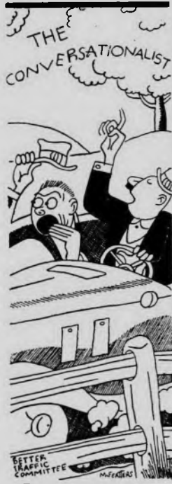
They say talk is cheap. Maybe it is—anywhere except behind the steering wheel of an automobile.

The Conversationalist who elects to demonstrate his talents while driving is literally talking himself into trouble—and usually serious trouble.