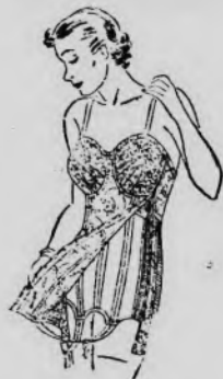
Side back foundation garment of fused fabric—low up-tilt bust and a well boned inner bod with diaphragm control. "GIVES YOU A FIGURE WOMEN DESIRE"