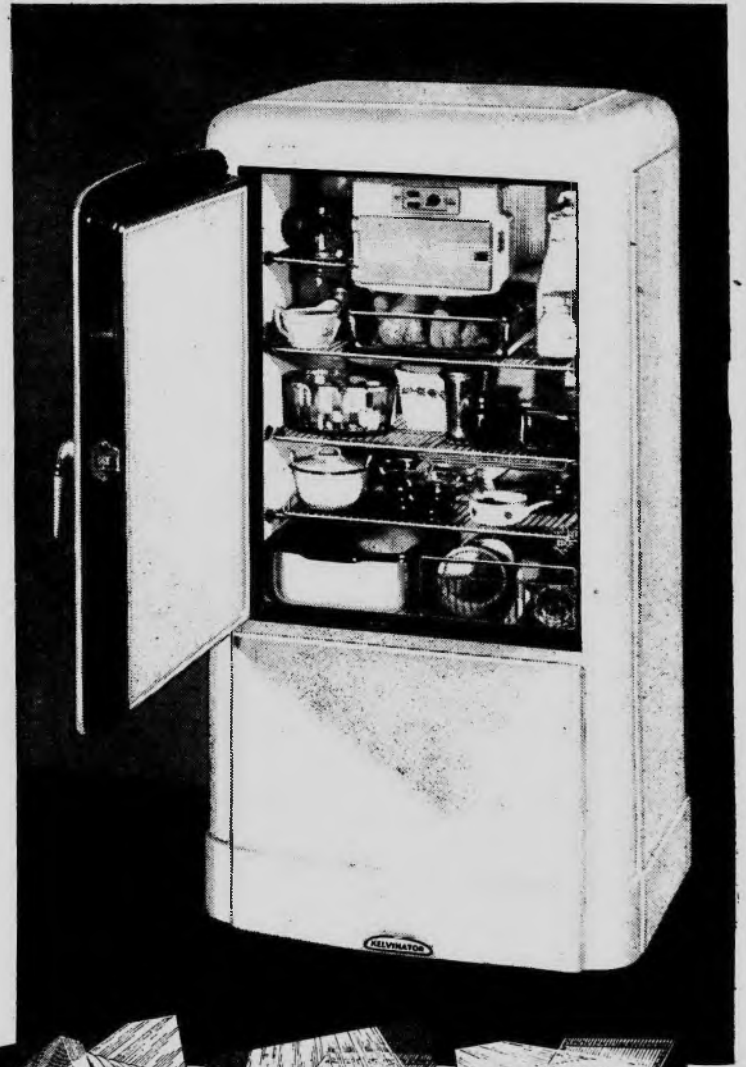
Model illustrated is KS-36

If you've waited until now—wait no longer. Come in to our store today and see the 1936 Kelvinator. We assure you that never before have we seen an electric refrigerator which in one year has stepped out so far ahead.