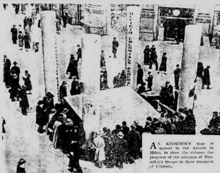
AN ENORMOUS map is spread in the Arcade in Milan, to show the citizens the progress of the advance of Mussolini's troops in their conquest of Ethiopia.