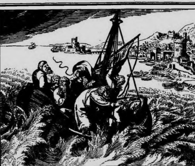
Christ Calms the Storm.—The subject of this illustration, from Merian's story of the Bible in pictures, engraved in 1625-1630, is taken from an incident related in the first three Gospels.