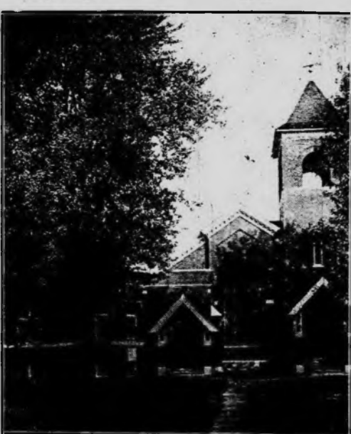
Plymouth's Beautiful Presbyterian Church Destroyed by Fire Thursday Evening, January 9th.