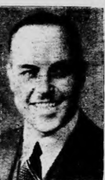
District Governor of Rotary is Plymouth visitor.