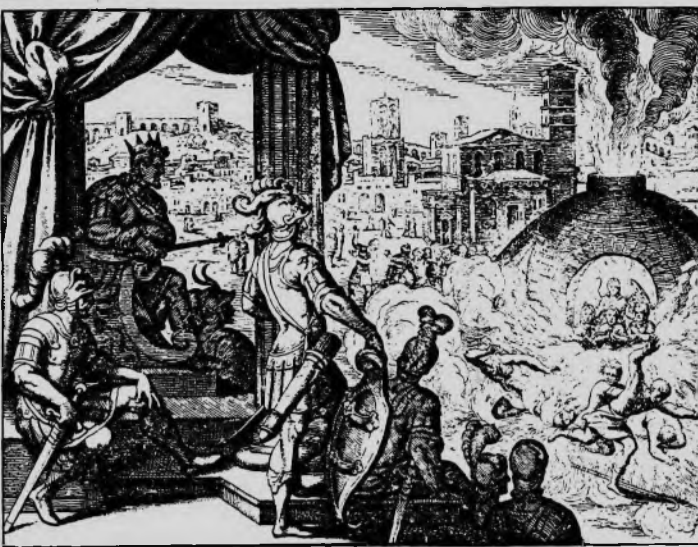
Shadrach, Meshach, and Abed-nego in the Fiery Furnace.—Nebuchadnezzar made a golden image in the plain of Dura and commanded that everyone should bow down and worship it. When the king refused to do so, he was thrown into a fiery furnace. Shadrach, Meshach and Abed-nego, upon their refusal to worship the idol, were cast into the midst of the fiery furnace. "And these three men, Shadrach, Meshach, and Abed-nego, fell down bound, into the midst of the burning fiery furnace. Then Nebuchadnezzar the king was astonished, and he said, 'I see four men loose, walking in the midst of the fire, and they have no hurt; and the form of the fourth is like the Son of God.' Then Nebuchadnezzar came near to the mouth of the burning fiery furnace, and spake, and said, 'Shadrach, Meshach, and Abed-nego, ye servants of the most high God, come forth. And the princes, governors, and captains, and the king's counsellors, being gathered together, saw these men, upon whose bodies the fire had no power.'—Daniel 3: 23-27. This illustration is from Merian's story of the Bible told in pictures, engraved in 1625.