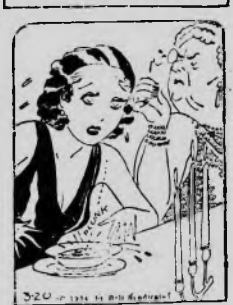
The girl chum says that, since she has quit wearing her hair bobbed, she believes she could win an international hairpin losing contest.