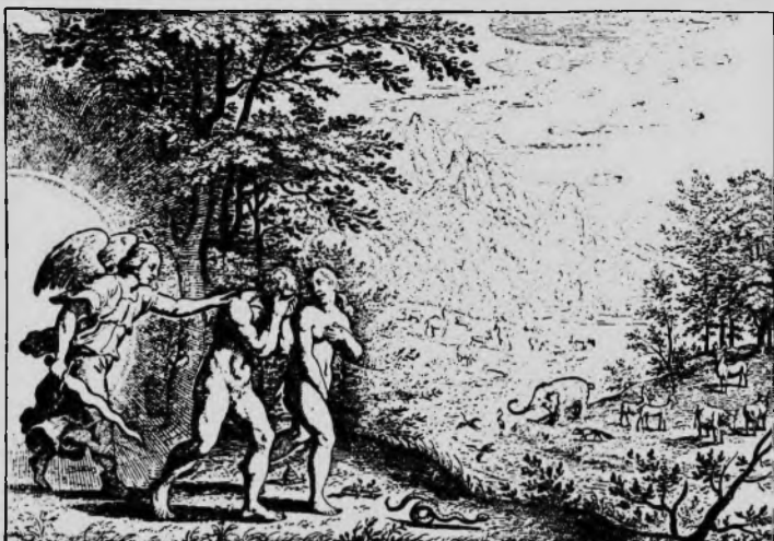
Cast Out of Paradise. —When Adam and Eve, disregarding God's commands, had eaten of the fruit of the tree of knowledge their eyes were opened, and they knew that they were naked. When they heard the voice of the Lord they hid from His sight. And when God questioned them Adam told how Eve had given him the fruit, and Eve in turn blamed the serpent who had beguiled her. God cursed the serpent, condemning it to travel on its belly all the days of its life. He cast man and woman out of the Garden of Eden, condemning the man to the tilling of the ground whence he came and the woman to the bearing of children. One of a series of Bible pictures by Merian, Seventeenth century engraver.

FIRST CHURCH OF CHRIST SCIENTIST Cor. Main and Dodge Sts. Sunday morning service, 10:30. Sunday school at 10:30. Pupils received up to the age of twenty years. Wednesday evening testimony service, 7:30.