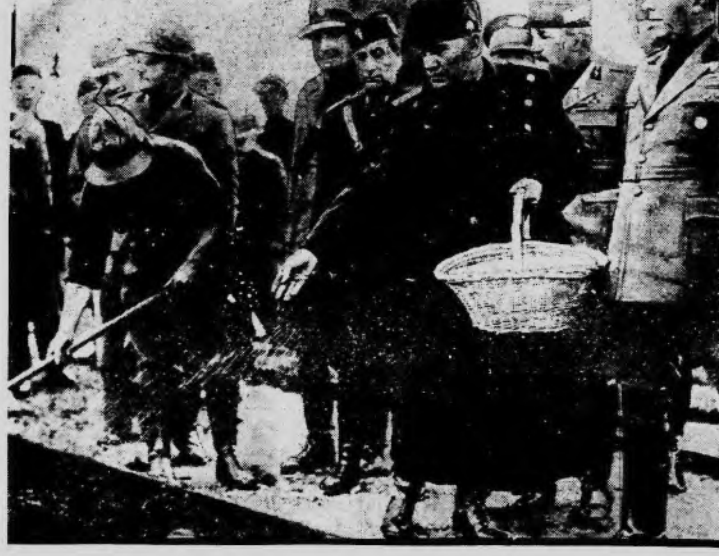
One of the pet projects of Premier Mussolini is the development of that section of Littoria which was made into farmlands after being reclaimed from the Pontine marshes. During a tour of the province he showed his skill in agricultural arts by sowing corn seed on some newly turned soil.