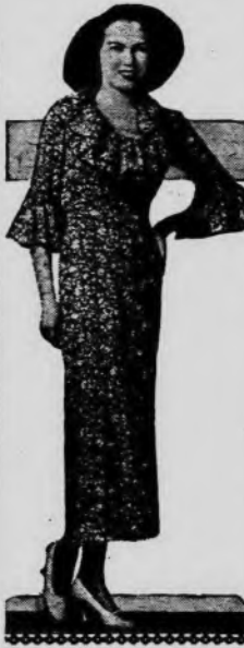
This pretty spring gown is notable for the charmingly young square neck line bordered simply with a doubled frill of the print to match that on the sleeves.