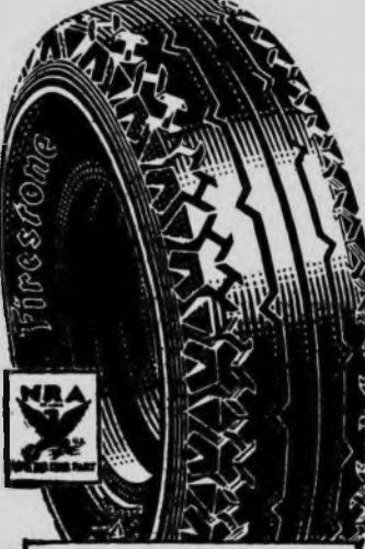
THE MASTERPIECE OF TIRE CONSTRUCTION

Firestone Tires are built with high stretch Gum-Dipped Cords. Every cotton fiber in every cord in every ply is saturated and coated with pure rubber. This extra Firestone process gives you 58% greater protection against blowouts.