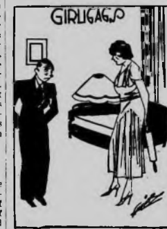
"The trouble with a wife who reads her husband like a book," says Oliver, "is, nine times out of ten she does it aloud."

You will enjoy bringing your banking business to us, and we shall enjoy counting you among our depositors.