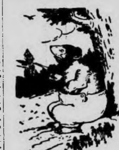
Buster Tipped His Head Back and Looked Up.

As he said this, Buster Bear sat and stared into the Laughing Brook with wrinkled brows. He had set out that morning to get fish for breakfast, and because he had set his heart on fish, nothing else would do. You know, Buster Bear is sometimes what is called pig-headed—that is, he starts to do a thing, and no matter what happens he persists in trying to do it. He had started out for fish that morning, and fish he would have or else go hungry. Now, everybody knows that it is of no use to try to drink from an empty pail, and every fisherman knows that it is of no use to fish when the fish have gone away from their favorite places. Buster Bear knew that for some unknown reason there were no trout in the little shallow pool where he does his fishing. Of course, he didn't know