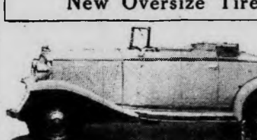
Photo shows new Rockne '65' Convertible Roadster equipped with the new 7.00x16 oversize balloon tires. The tires require only 20 pounds air pressure both front and rear.