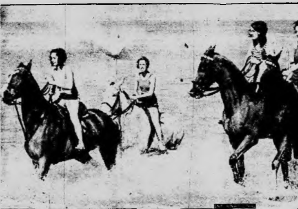
"SEA horses" take to the strand of the Hollywood Riviera club near Redondo Beach, Calif., where, with bathing suits substituted for riding habits, equestrian sports have become a popular beach activity. Even the horses seem to enjoy the novel change from bridle path to beach.