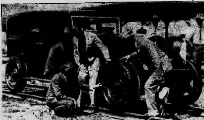
Harvey S. Firestone (left foreground) stands the new Firestone rail tires in perfect condition after they had enabled an automobile running on railroad tracks to set a record between Miami and Jacksonville, Florida.