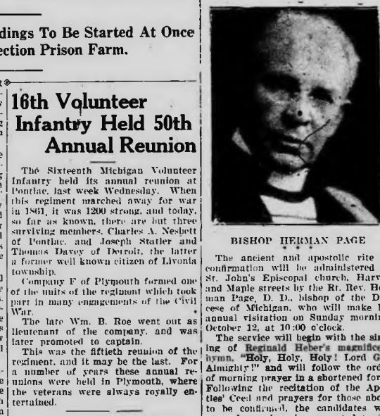
BISHOP HERMAN PAGE